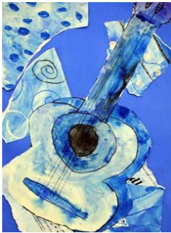
Picasso's Blue Period "Guitar"

difficult time in his life. Picasso recalled that he might have started painting in blue when he heard of his friend's death. No matter what caused him to start or whatever caused him to stop. Pablo Picasso's blue stage remains important.