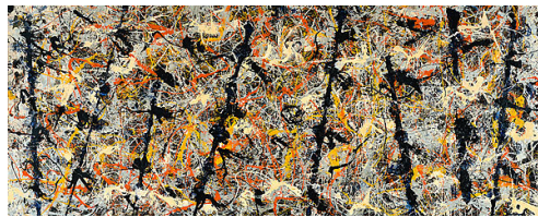
The original artwork "Blue Poles" to learn more visit http://pollockprints.org/blue-poles/

his first solo show where a large group of people could view a lot of his paintings. He died August 11, 1956 in a massive car accident. Jackson Pollock is famous for his painting called "Blue Poles." "Blue Poles" is an abstract painting that was purchased by the National Gallery of Australia in 1973.